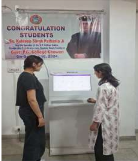
TWO KIOSKS WITH SOUL 3.0 INTALLED IN LIBRARY GOVT. COLLEGE CHOWARI

5.4.4. The digital library is equipped with modern facilities to ensure efficient access to digital books, journals, and databases. With the installation of two user-friendly kiosks, students can easily explore resources and stay academically updated. It promotes a flexible and technology-driven learning environment.